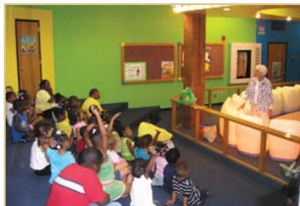
Program in process at the newly painted DDHT

This year’s golf tournament was very successful, netting DDHT over $28,000. The funds will be put to good use, providing scholarships for underserved children to attend DDHT, and providing dental supplies which are given at no charge to every child who attends DDHT. DDHT hosts over 10,000 young guests each year.